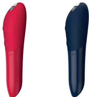
Cherry Red Midnight Blue